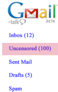
Figure 2: An hypothetical open channel.

one set of conditions sufficient to guarantee this result.