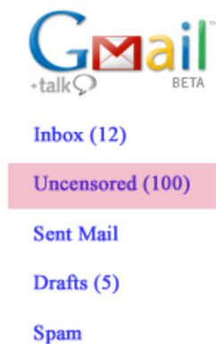
Figure 2: An hypothetical open channel.

no longer justify the incremental costs. 6 In our formal model below we show one set of conditions sufficient to guarantee this result.